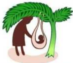
BIRTHING IN THE PACIFIC

For the very first time, we have a Soroptimist project that was created in SI South West Pacific and became a federation project before being selected as the 2011 December 10 th Appeal project. This project is called 'Birthing in the Pacific' ( http://www.soroptimistinternational.org/our-projects/december-10-appeal/birthinginpacific ) and works to increase the skills and education of health professionals and birth attendants in Papua New Guinea with the goal of reducing maternal mortality and morbidity. This project supports Millennium Development Goal #5 which is to improve maternal health.